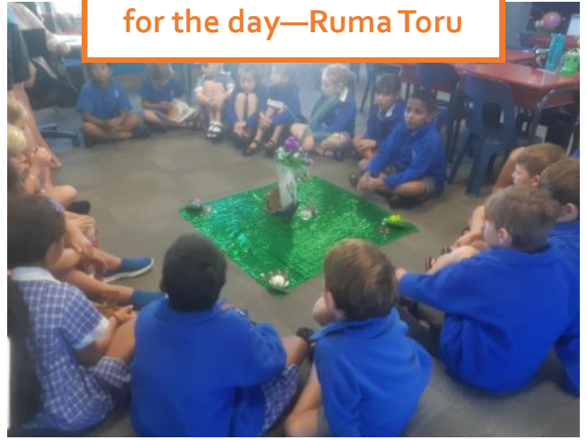
Morning Prayer to prepare for the day—Ruma Toru